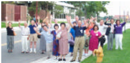
Walking to the dining room for breakfast.