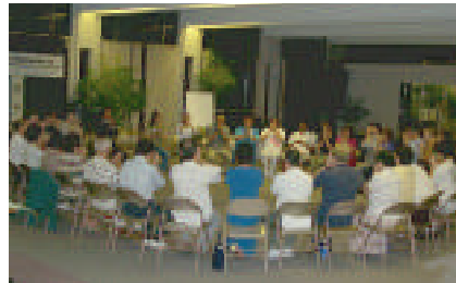
Candleless Candle Light Ceremony

Thanks to all the Colorado members who were so gracious and made everyone feel so welcome. We wish them much success in the years to come. The 25th ISTS was surely a "booster shot" for repeaters and definitely, a terrific learning session for the newcomers. Overheard was this comment, "Coming to