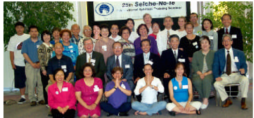
Twenty-Eight first timers at 25th ISTS (not all present for this photo.)

The 25th International Spiritual Training Seminar at Denver University in Denver, Colorado was a resounding success. There were 43 participants with 28 newcomers! (First-timers) They came from Connecticut, New York, Florida, Brazil, Washington, California, British Columbia, Hawaii, Ontario and of course, Colorado. The lecture hall was filled with sounds of gratitude as the trainees listened and learned about the teachings of SNI and participated in the ceremonies of Mind Purification, Ancestral Memorial, Shinsokan for Mutual Prayers and Candlelight. Up at 6 a.m. and in bed usually around 11 p.m., the trainees were immersed in the wonderful Truth – Man is a Child of God, perfect and