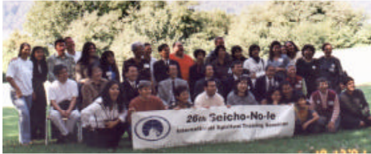
26th SNI International Spiritual Training Seminar